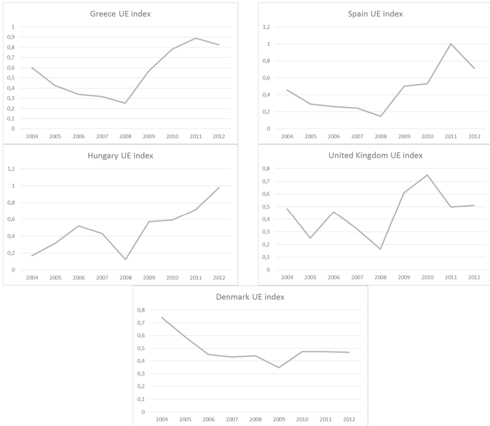
Figure 4. UE index flow through the years for second group