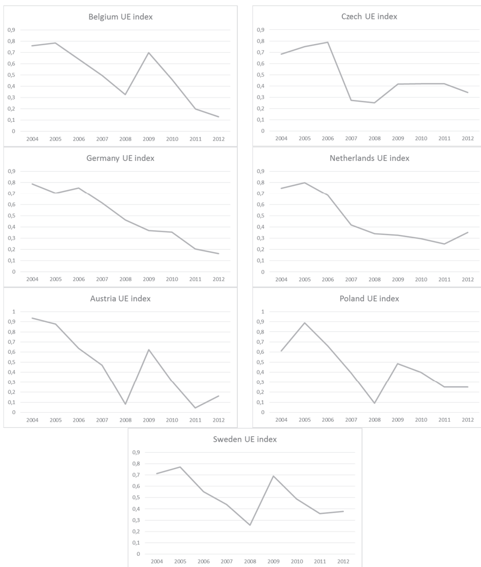
Figure 3. UE index flow through the years for first group

UE index flow for first group of the countries is presented in figure 3. First group is consisted of countries with the trend of, mostly, decreasing level of underground economy for the period 2004-2012. We believe those are countries that experienced crisis the least. Germany is only country with almost linear decrease in the whole period from 2004 till 2012. There are only two slight exceptions in 2005 and 2010. The similar trend is noticed in the case of Netherlands. However, Netherlands UE index growth in the 2013 is worrying.